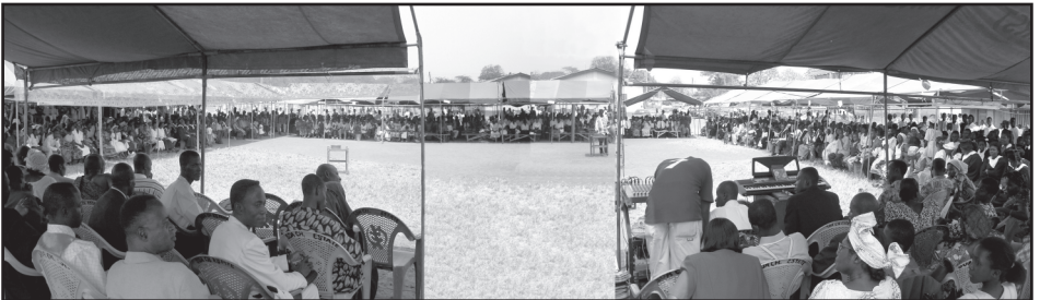
About 2,000 People at a Camp Meeting in Ghana, Africa, January 2004

Thank you for your consideration and your prayers. >>