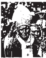
The Pope, strong signal

Make it clear that Sunday must not be worked, since it must be celebrated as the day of our Lord